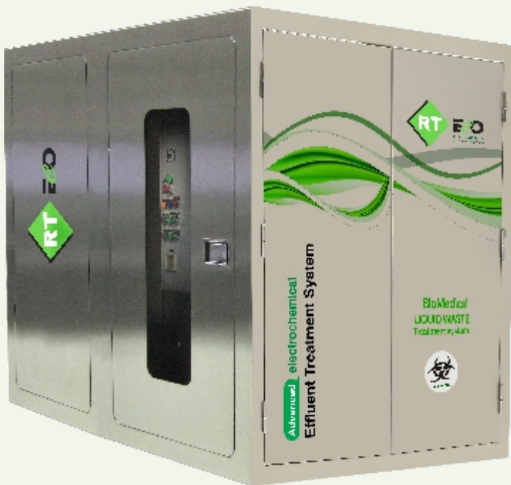
Containerized System (Commercial)

RT ECO Biomedical Liquid Waste Treatment Systems are hybrid electrochemical system that are compact, eco-friendly and efficiently destroys biomedical pollutants and harmful pathogenic organisms such as bacteria and viruses.